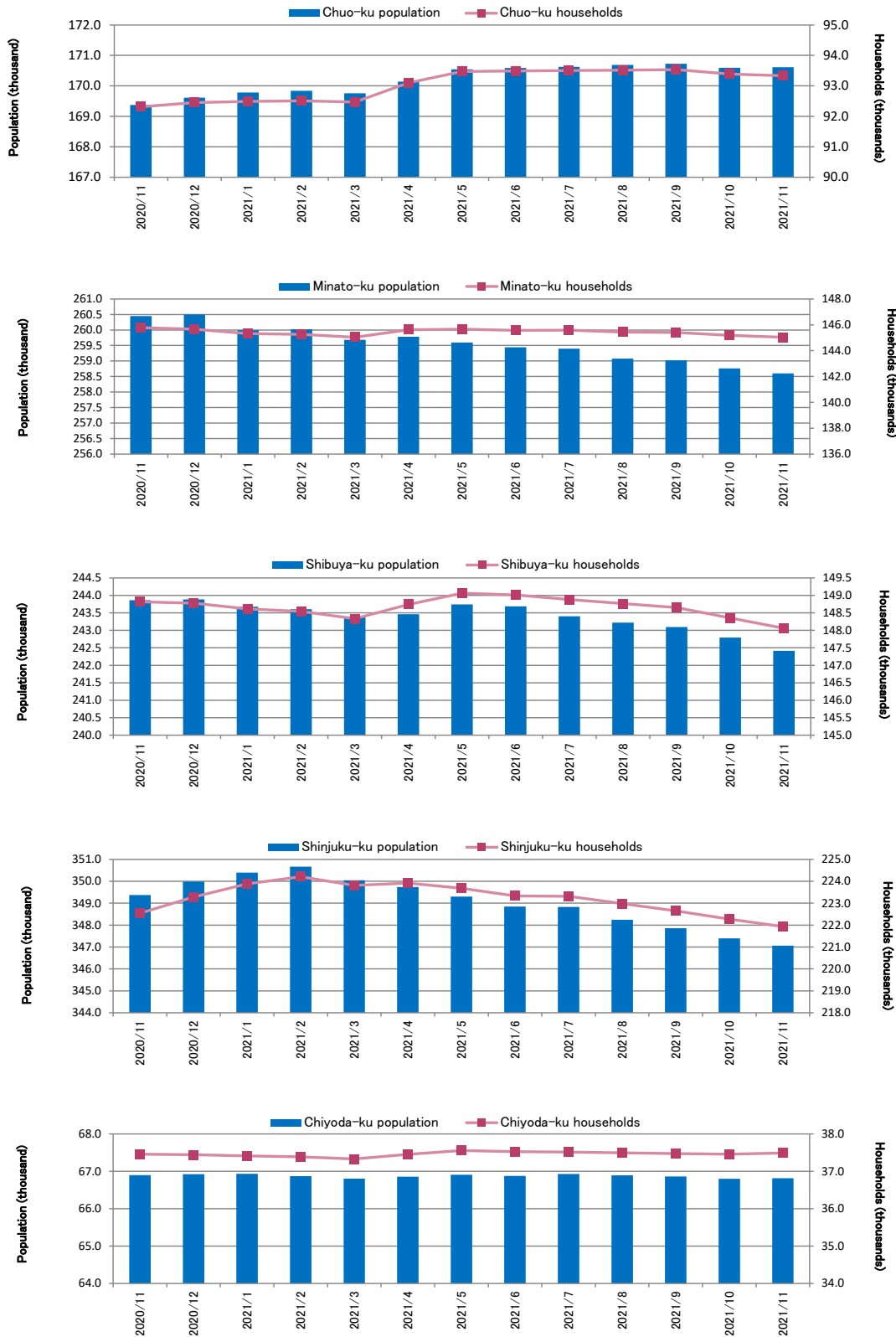
Chart ③ Population and Number of Households in 5 Wards of Central Tokyo