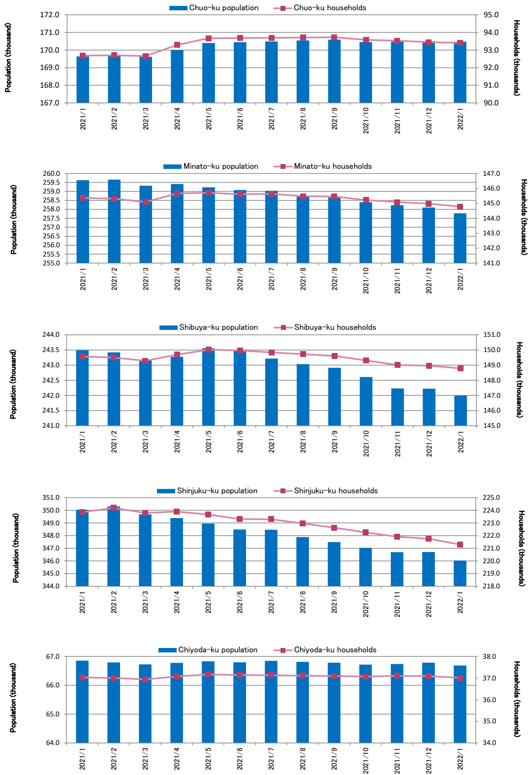
Chart ③ Population and Number of Households in 5 Wards of Central Tokyo