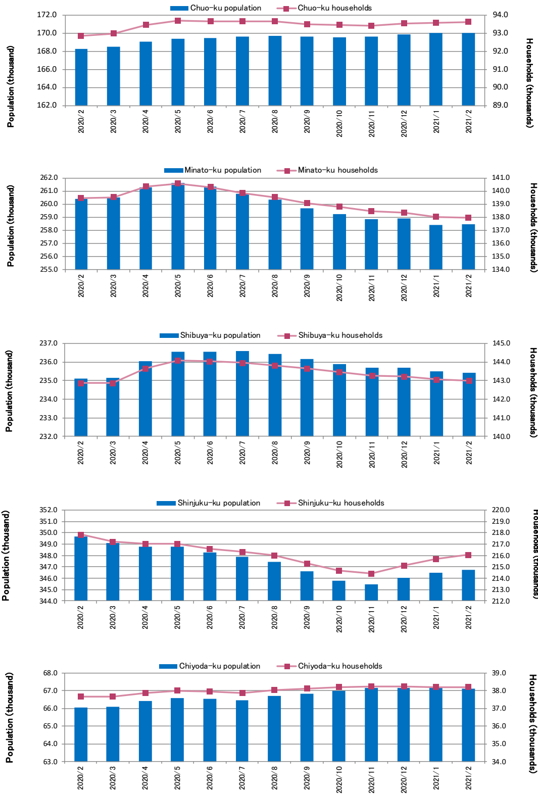
Chart ③ Population and Number of Households in 5 Wards of Central Tokyo