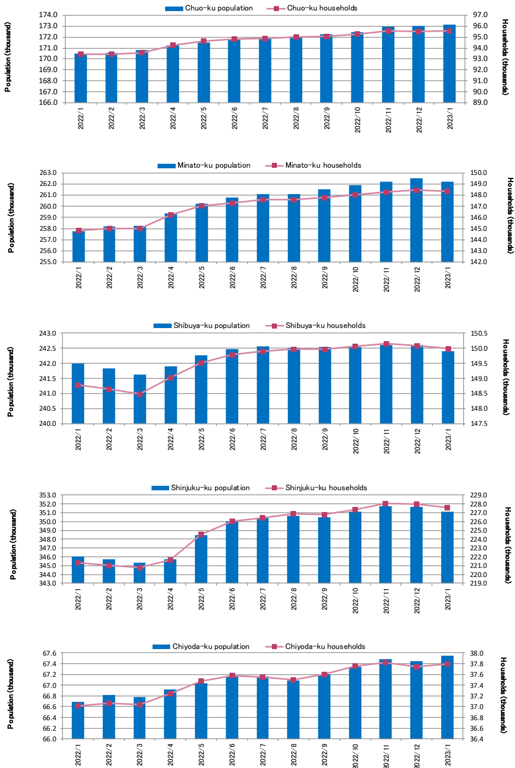
Chart ③ Population and Number of Households in 5 Wards of Central Tokyo