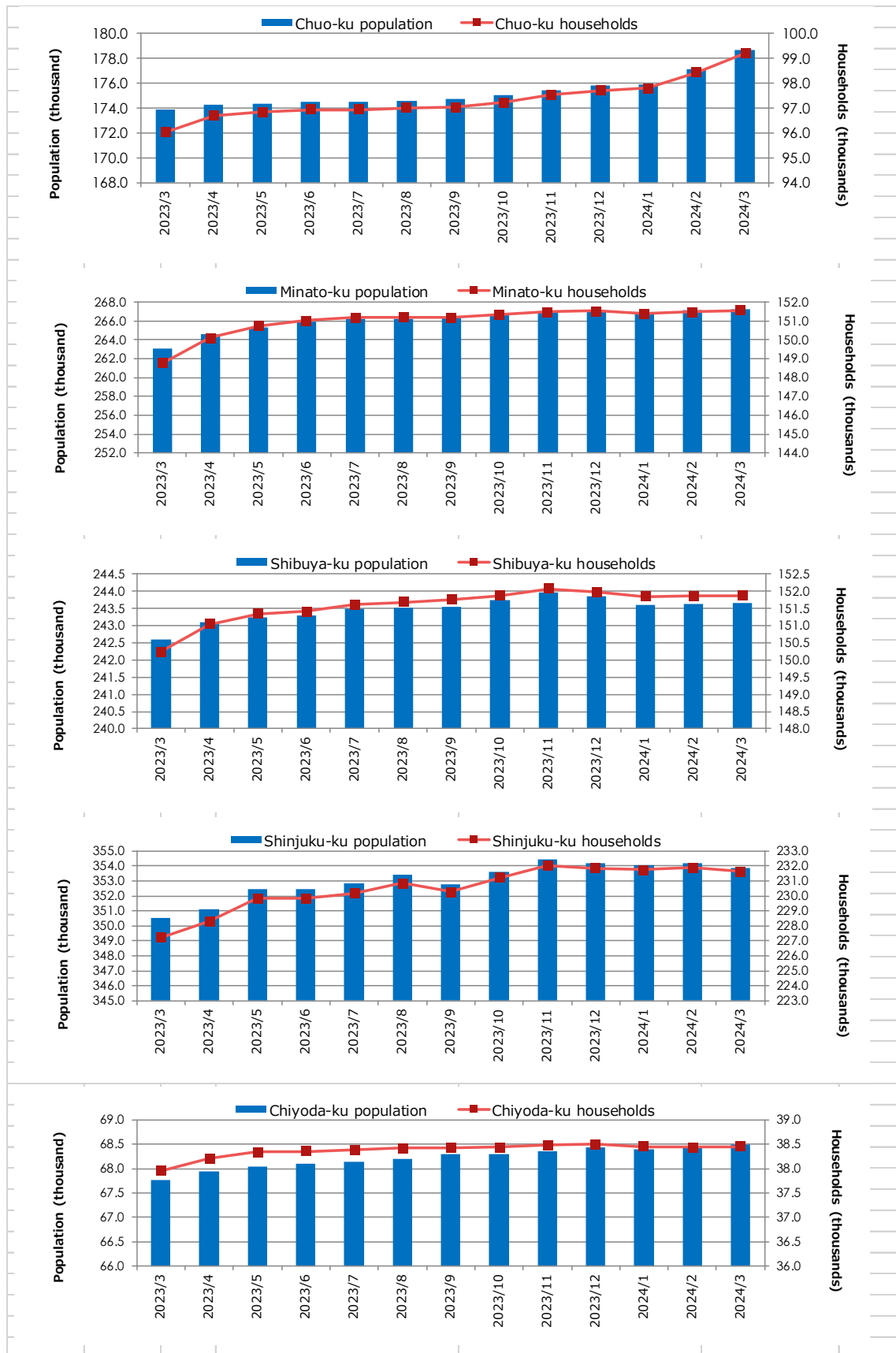
Chart ③ Population and Number of Households in 5 Wards of Central Tokyo